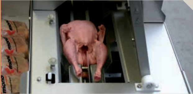
Positioning of the birds into the Maxipack